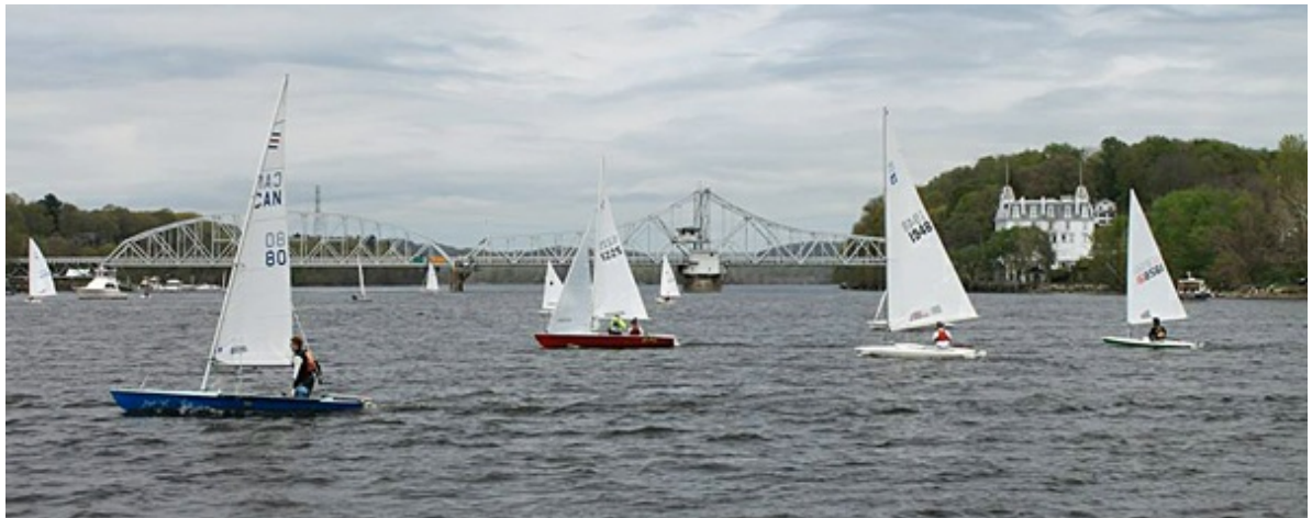
Fifth Annual Connecticut River Dinghy Distance Race on May 9.