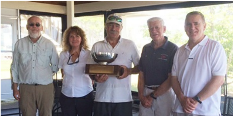
HAWKINS PYC TEAM RACE WINNERS (PYC vs ECYC)