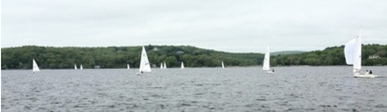
COMMODORE'S HANDICAP RACE - MAY 16, 2015