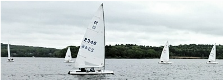
ONE DESIGN REGATTA - MAY 23, 2015