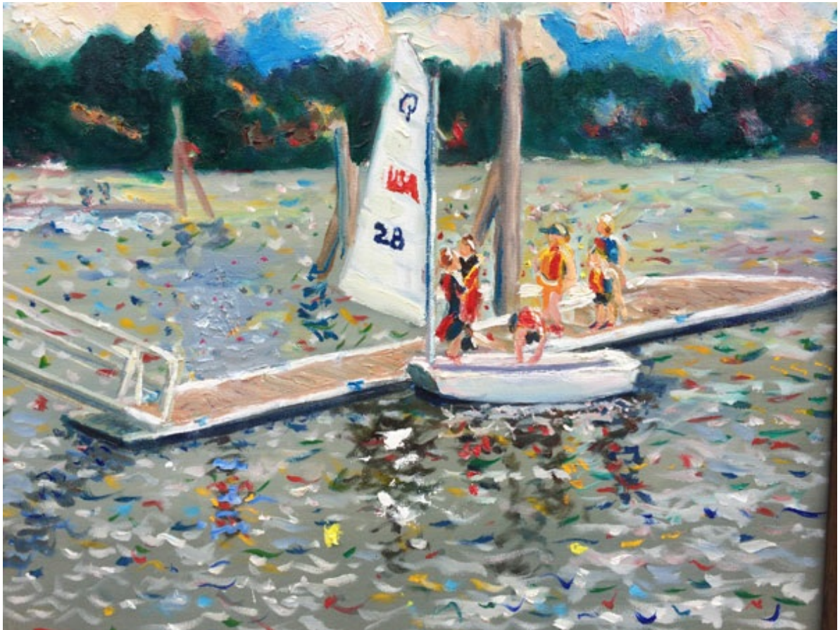
"The Sailing Class" by Max Greenwood (2016)