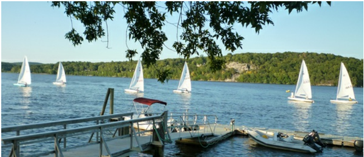
MC Scows competing on a Tuesday evening last summer.